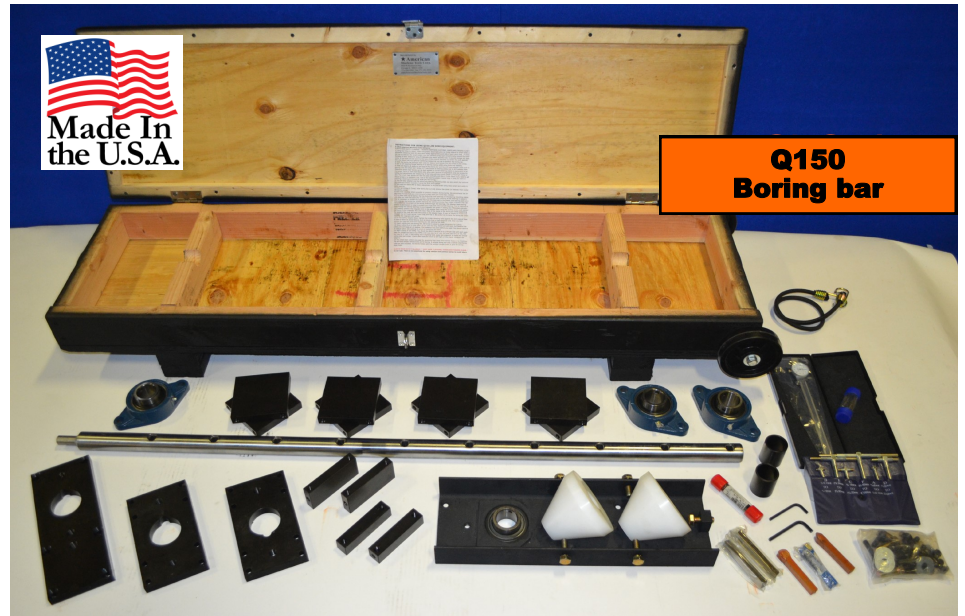
Q150 Boring bar